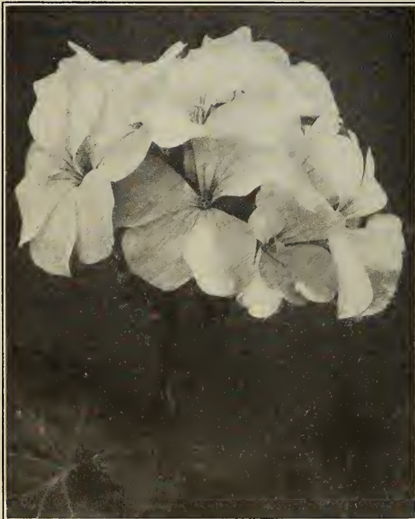
Clifton—See page 14

Uranus. (Can.) Rosy cerise, white eye; large trusses; fine, sturdy habit. Verger Fleuri. (Brt. 1909.) Enduring pure white flowers; strong, compact grower. Victorien Sardou. (Lem. 1909.) Immense flowers and trusses of a blood-red-scarlet shade. Warley. (Can.) White ground, maculated rosy lake, boldly margined with orange scarlet; most attractive shade. Wilbur Wright. (Roz.-Bou. 1909.) Pure white flowers, with purple stripe. Wilhelm Pfitzer. (Pfit.) A most attractive shade of cardinal red, white eye. Yvon d'Angeniecq. (Brt. 1907.) Intense violet, showing a light tinge of solferino, maculated with scarlet at base of petals, white eye.